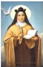
~ St. Therese of Avila

"May today there be peace within. May you trust God that you are exactly where you are meant to be. May you not forget the infinite possibilities that are born of faith. May you use those gifts that you have received, and pass on the love that has been given to you. May you be content knowing you are a child of God. Let this presence settle into your bones, and allow your soul the freedom to sing, dance, praise, and love. It is there for each and every one of us."