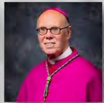
Bishop Gregory Studerus